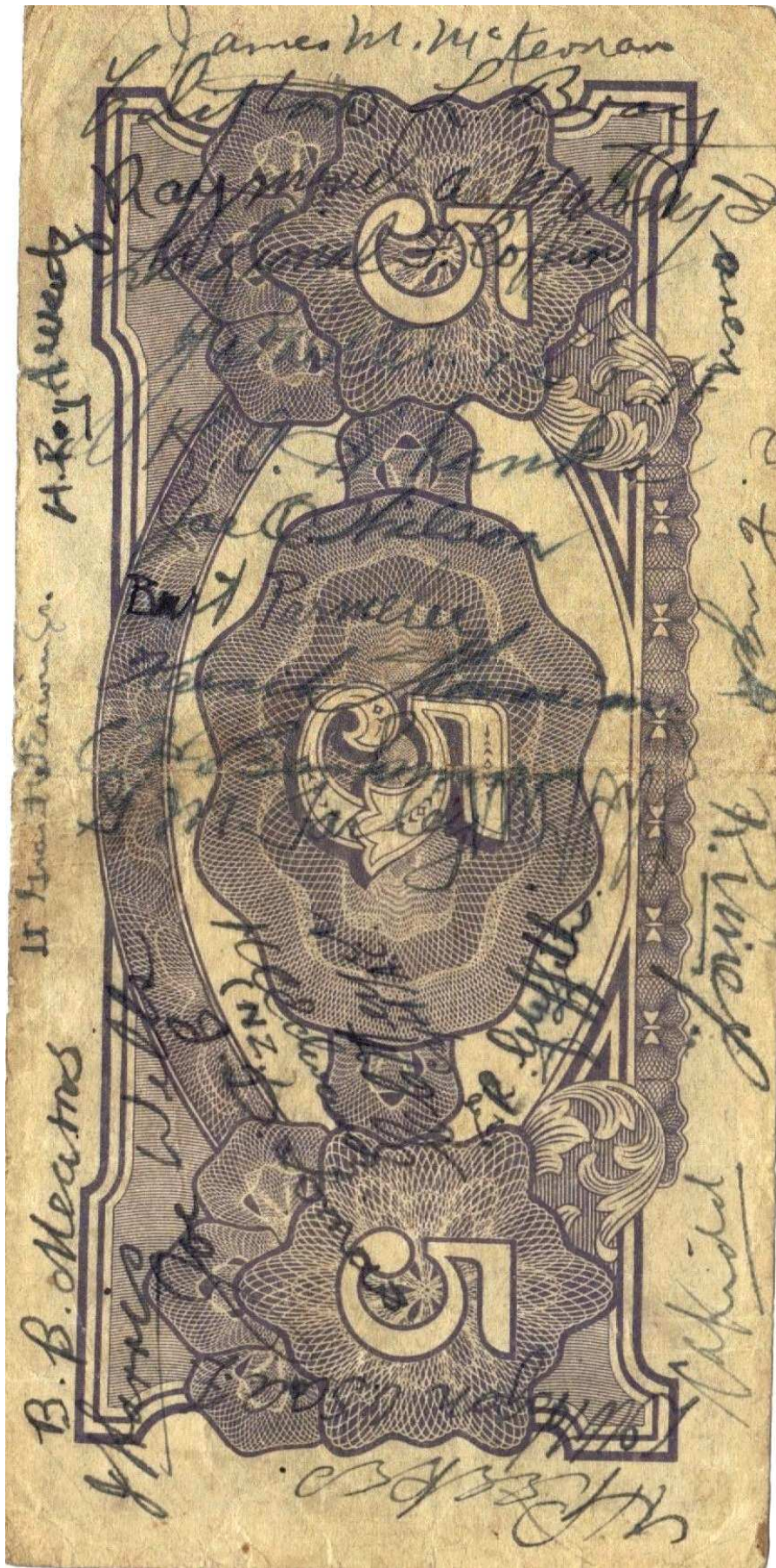
POW survivor Dick Corbett's Japanese occupation of Burma five rupee note, bearing 26 signatures of POWs (24 air force men, 1 British Army private, 1 unknown) liberated from Rangoon Jail on 3 May 1945 [Version 10]